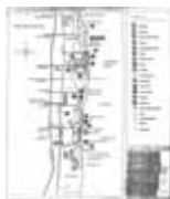
Figure 3. Site Location Map