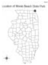
Figure 1. Location of Illinois Beach State Park